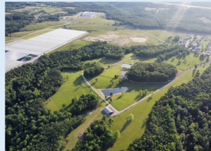
(Above) Overview of park

The Rowan County Fiscal Court is excited to announce that a new park is being developed!